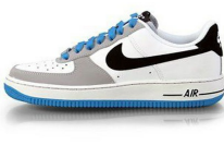
Air Jordan 13 Retro shoes black white ID:6061 Free Shipping